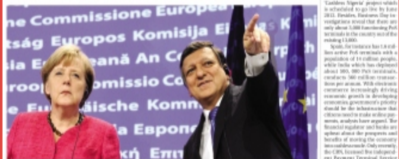
Spain's Economy Minister (left) joins a press conference after meeting with European Commission chief, Jose Manuel Barroso, at the EU headquarters in Brussels, yesterday.

Spain, for instance has 1.6 million active POS terminals with a population of 45 million people, while India which has deployed about 200, 000 POS terminals, reaches 100 million people per annum. With electronic commerce increasingly driving economic growth in developing economies, government's priority should be the infrastructure that electronic commerce requires, analysts have argued. The financial regulator and banks are expected to report on the progress and benefits of moving the economy towards cashless. Only recently, the CBN launched the Integrated Payments Terminal Service (ITS) pilot with the singular